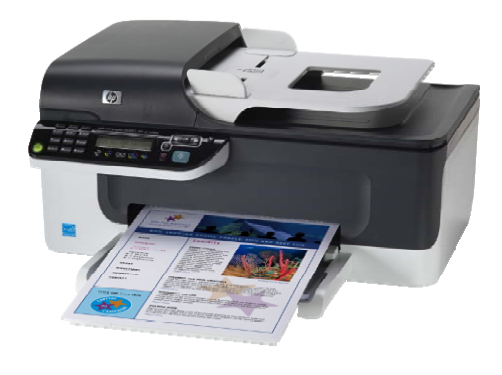
HP Officejet J4580 All-in-One

These impressive new ink cartridges benefit from tested, successful HP technology as well as a number of HP innovations. Read on to learn more about how HP is advancing print cartridge technology.