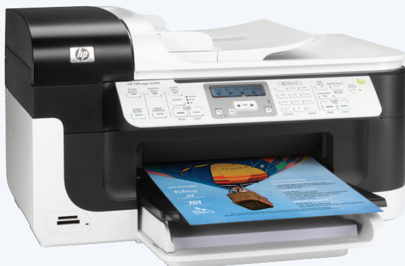
HP Officejet 6500