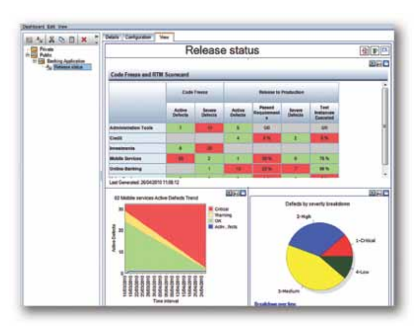
Figure 1 Plan, track, and manage the lifecycle of modern applications with HP Application Lifecycle Management software

HP Application Lifecycle Management removes the gaps between IT team silos and disjointed work processes related to project planning, requirements definition and management, development and testing activities, defect tracking, and application readiness and release. It provides complete line-of-sight across teams throughout the application lifecycle, preparing all stakeholders for the impact of change driven by application transformation and modernization and reducing the "time to know" that can result in the lack of delivery readiness. HP Application Lifecycle Management manages the lifecycle across all application aspects (architecture, functionality, performance, and security) with a single software platform, an integrated repository, consistent user experience, and a set of extensible application programming interfaces.