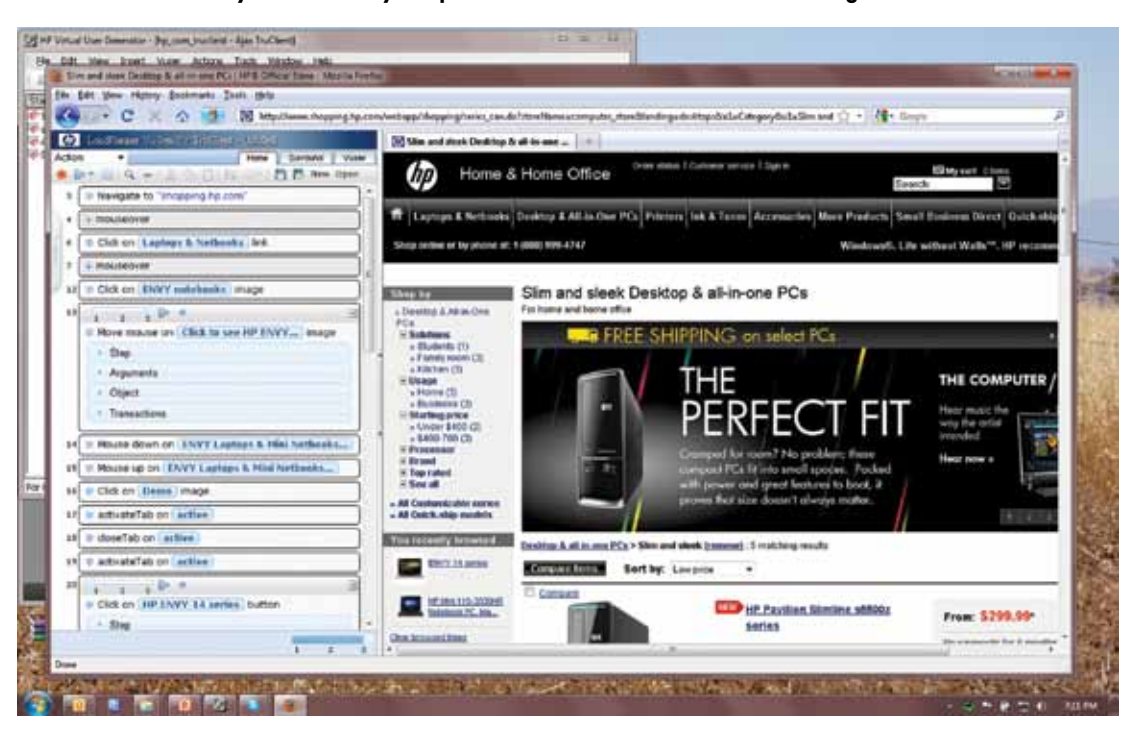
Figure 3 HP LoadRunner: The industry's most widely adopted software for automated load testing