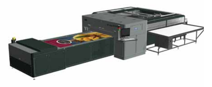
HP Scitex FB7500 Industrial Press