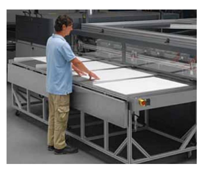
Loading 4 sheets simultaneously with alignment to the left