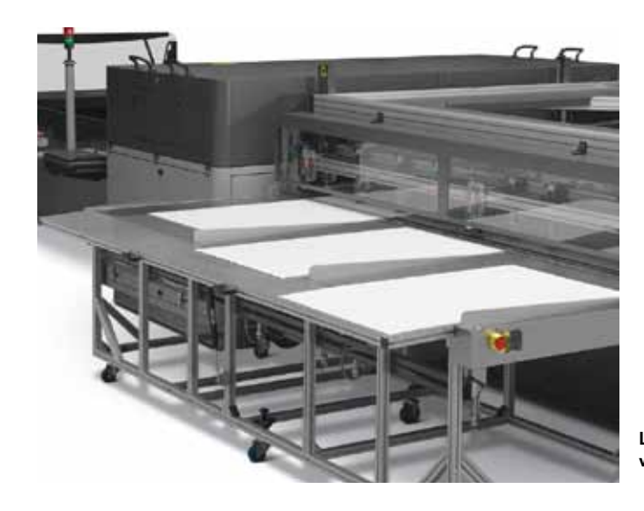
Loading 3 sheets simultaneously with alignment to the right

Take your productivity to new levels and print more jobs faster and with better efficiency with the multi-sheet loading table. This optional table allows your operator to simultaneously print on up to 4 pre-cut sheets, shortening the turnaround time and reduce waste by eliminating cutting. And, to align the sheets to either the right or left side, for increased efficiency of double-sided printing.