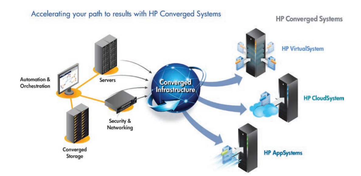
Figure 6: Using HP Converged Storage to built new solutions