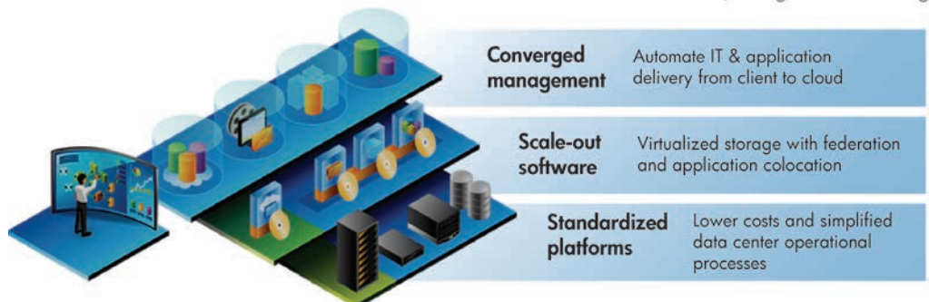
Only HP provides innovative solution in all these three areas.

Remove boundaries between server, storage and networking